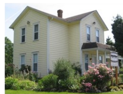
Heslin House Museum & Gardens