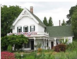
Zimmerman House Museum & Gardens